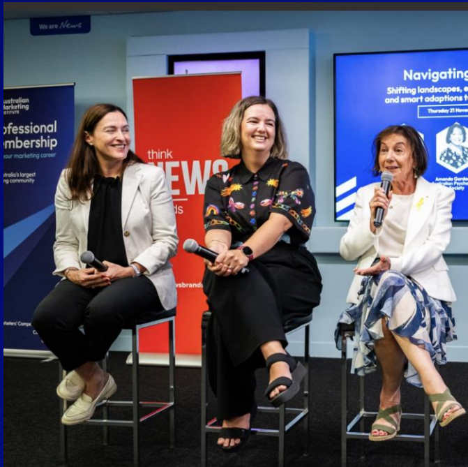
Networking /Thought leadership #1 $5000 per event